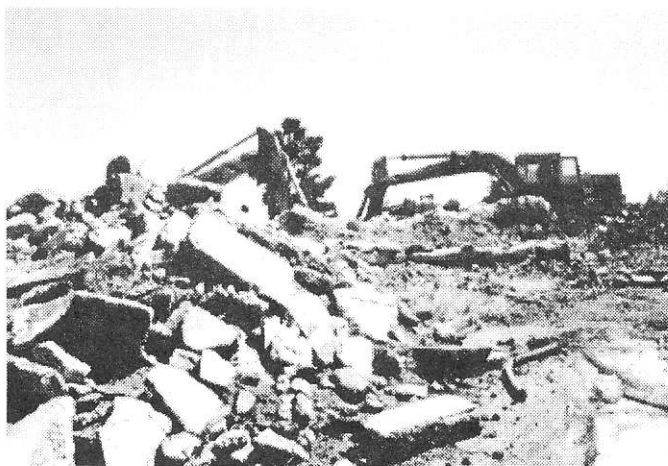
College Wing, Top of Circle-June, 1998

The old College, the faculty, the great numbers of wonderful students whom I meet now as fathers, Fathers, grandfathers, Monsignors, clerics, laymen who have enriched my life—these are the reminiscences that continue to delight and make golden my present years and those yet to come ■