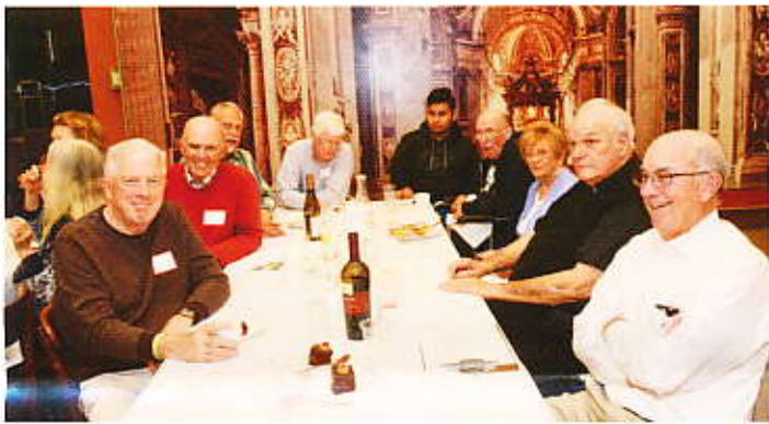
A happy gathering