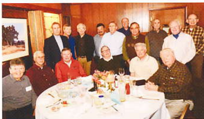
Alumni Board gathered for lunch