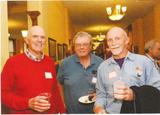
Friends sharing drink and food