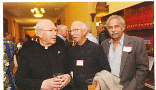
Friends catching up