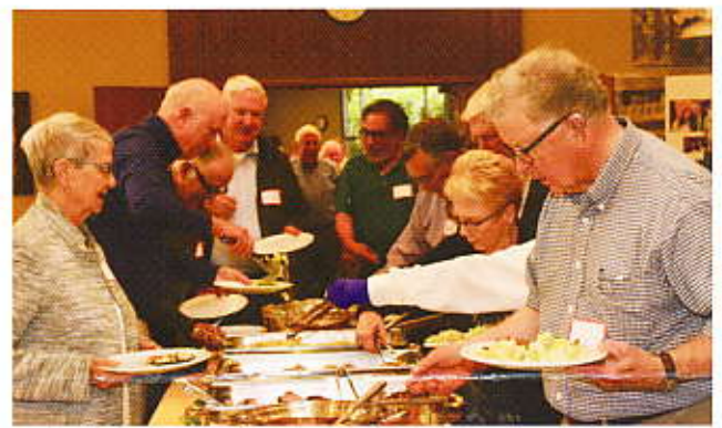
Enjoying wonderful food