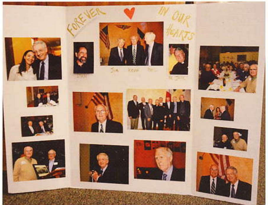
Remembering some of those who left us