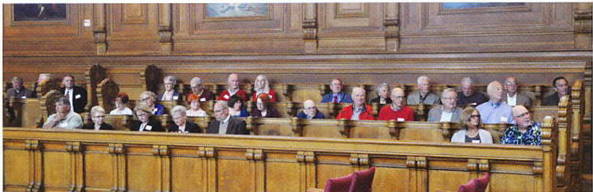
Gathering for Prayer

Alumni Day, April 28, 2018 - was a great success. More than 200 Alumni, spouses, and friends came together to celebrate friendships and memories. Family and friends