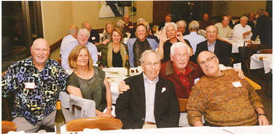
Honored Alumni Class