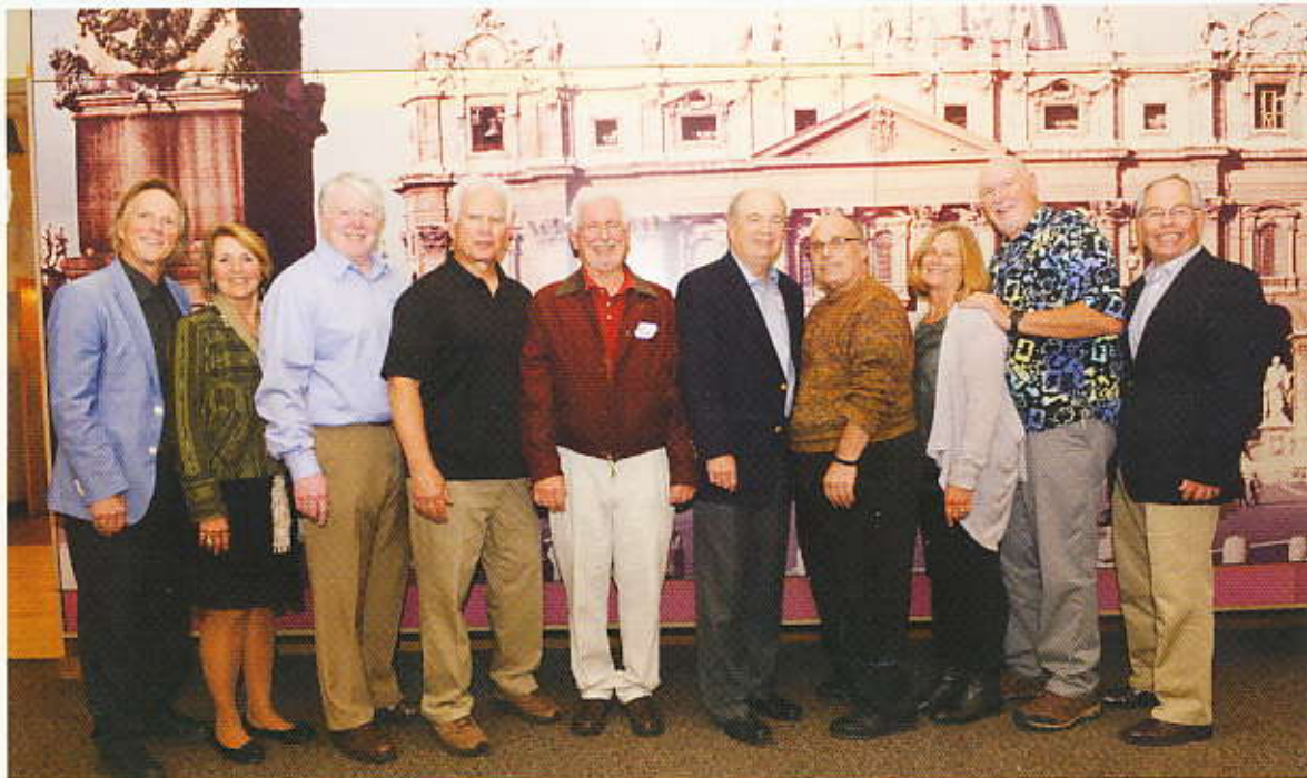
One of the honored classes at Alumni Day 2018