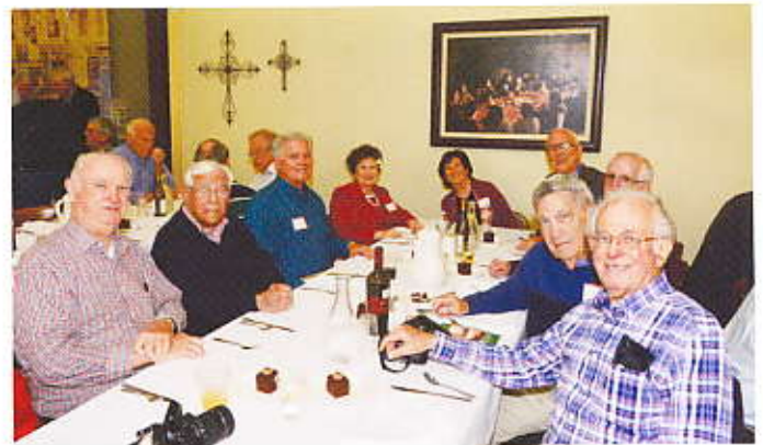
Honorees of 60th Rhet Class