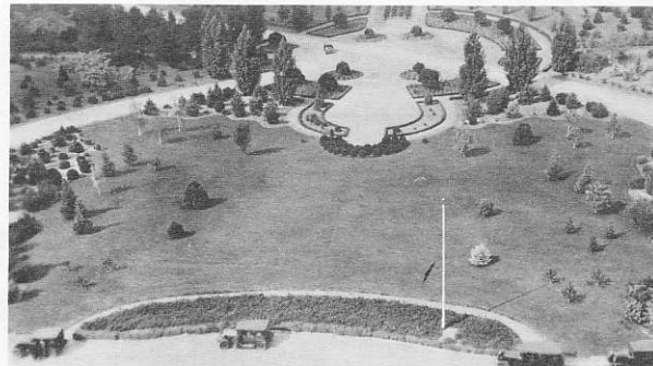
VIEW FROM ST. JOSEPH'S TOWER