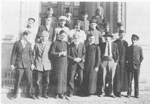
CAST OF PLAY - 1929 ST. JOSEPH'S