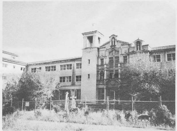
11/93 Facade of Chapel and wings. Note statue of Christ on the Cross is now facing building.