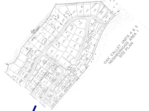
The site development map superimposed upon The St. Joseph's Seminary grounds map

The swimming pool & gymnasium (or the old tennis courts) were located at what is now 10918, 10908, 10898 Sycamore Court.