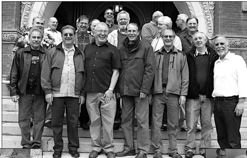
Class of '65 on steps of St. Pat's

WE WON THE GOLD! We know each other. YOU are the Gold Medals!